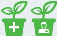
A TRIAGE SERVICE START UP ASSISTANCE

THE INNOVATION SUPPORT FOR BUSINESS (ISfB) PROGRAMME OFFERS SERVICES TO HELP LOCAL COMPANIES GROW AND CREATE NEW JOBS: